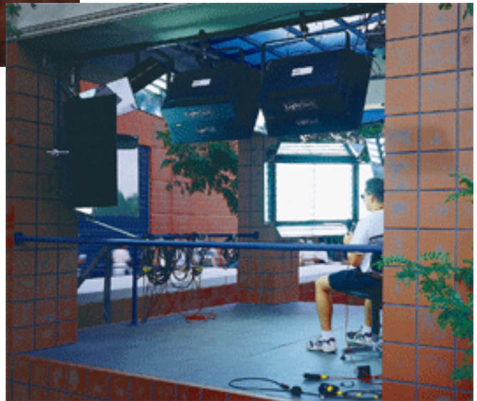
U.S. Tennis Open, Forest Hills